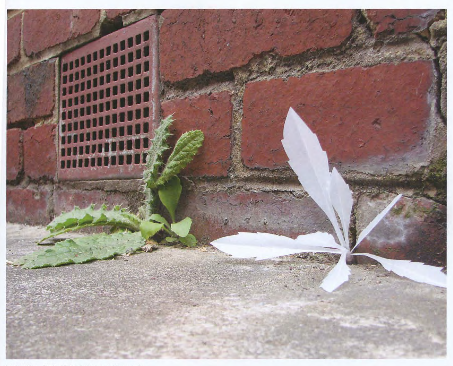
It's Nothing... Really (2006), single-channel video projection